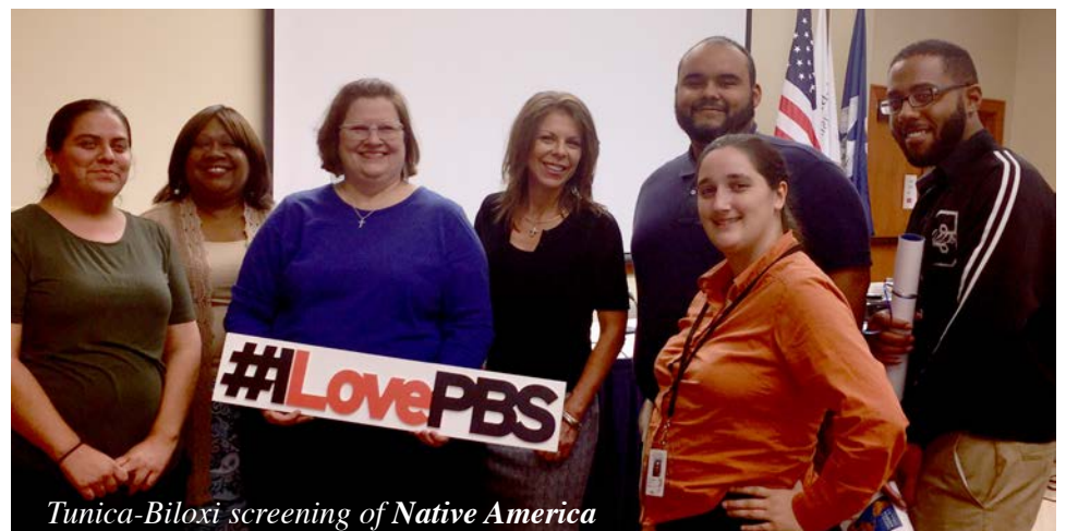
Tunica-Biloxi screening of Native America

On November 10, LPB collaborated with the Louisiana Book Festival to present The Great American Read Debate at the Louisiana State Capitol. The distinguished panel discussed the