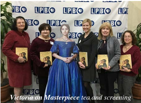
Victoria on Masterpiece tea and screening

Since 1975, Louisiana Public Broadcasting (LPB) has been Louisiana's public television state network with stations in Alexandria, Baton Rouge, Lafayette, Lake Charles, Monroe and Shreveport. LPB also owns 50% of WLAE-TV, a hyper-local (and former PDP) public television station in New Orleans. In addition to our award-winning documentaries about the history, culture, music, and people of Louisiana, timely news and public affairs programming, LPB is also dedicated to helping children throughout the state develop their literacy, math and science skills through our many educational outreach activities, teacher workshops, summer camps and fun station and community program related events.