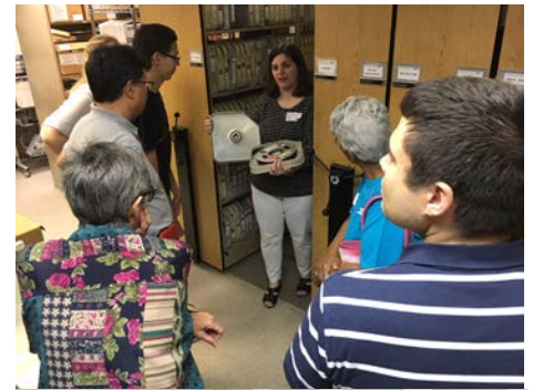
Transcribe to Digitize Challenge