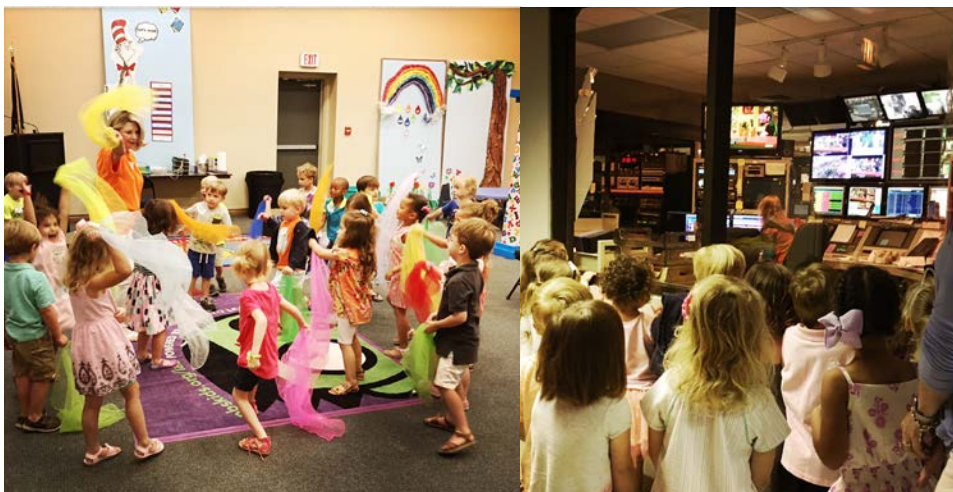
LPB's Literacy & Technology Summer Camps

Also in June, the New Orleans Jazz Museum hosted Celebrating the Jazz Photography of Herman Leonard where LPB's documentary, Frame After Frame: The Images of Herman Leonard was shown.