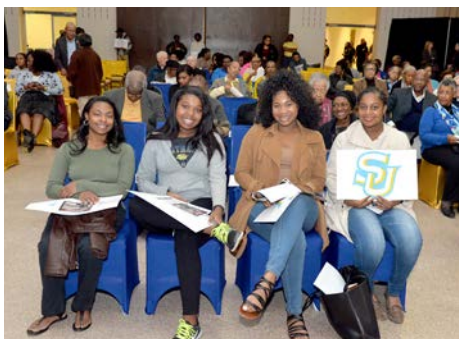
Tell Them We Are Rising screening and discussion

LPB was one of four stations nationwide awarded the opportunity to present a film screening and community engagement initiative about the life and work of late playwright Lorraine Hansberry. On February 26, over 200 guests attended the film screening of the American Masters documentary Lorraine Hansberry: Sighted Eyes/