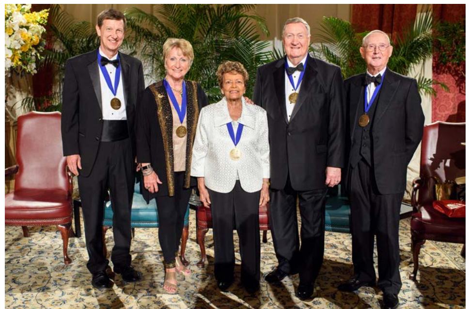
2018 Louisiana Legends

In May, LPB offered two STEM workshops at Shiloh Baptist Church for 5-10 year olds as part of Baton