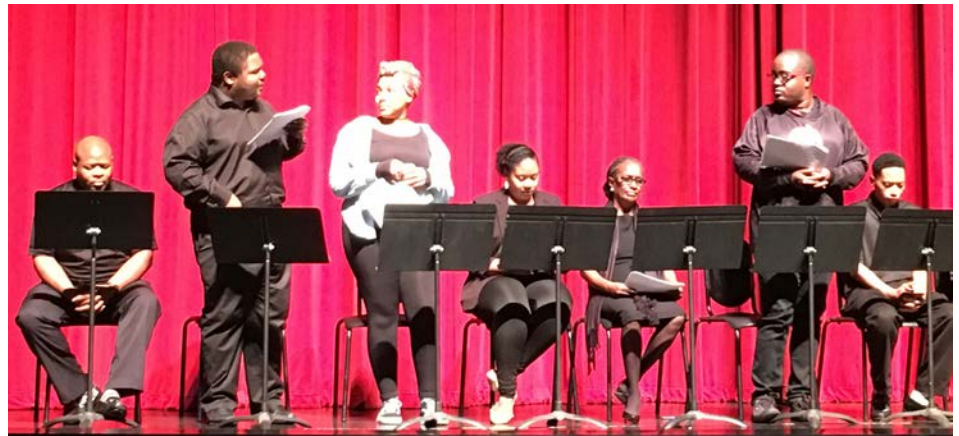
Lorraine Hansberry documentary screening