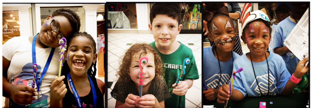
Our Lady of the Lake's Mommy and Me event at the Mall of Louisiana.