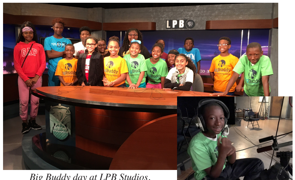
Big Buddy day at LPB Studios.

program, had a year full of timely, and sometimes controversial, subjects including: Black & The Blue; Fiscal Reform 2017; Coastal Restoration: The Next Wave; Reforming Criminal Justice; Industrial Tax Matters; Studying TOPS; Louisiana Veterans Coming Home; HIV/AIDS in Louisiana; and Louisiana: Sportsman’s Paradise or Problem? The program brings together experts and viewers to debate the topic in a town hall setting.