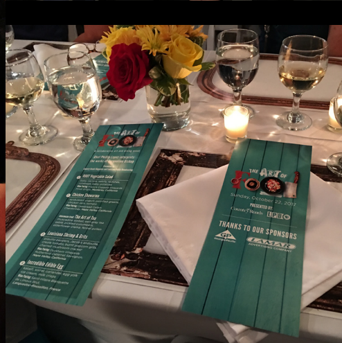
The Art of Food event at LPB Studios.