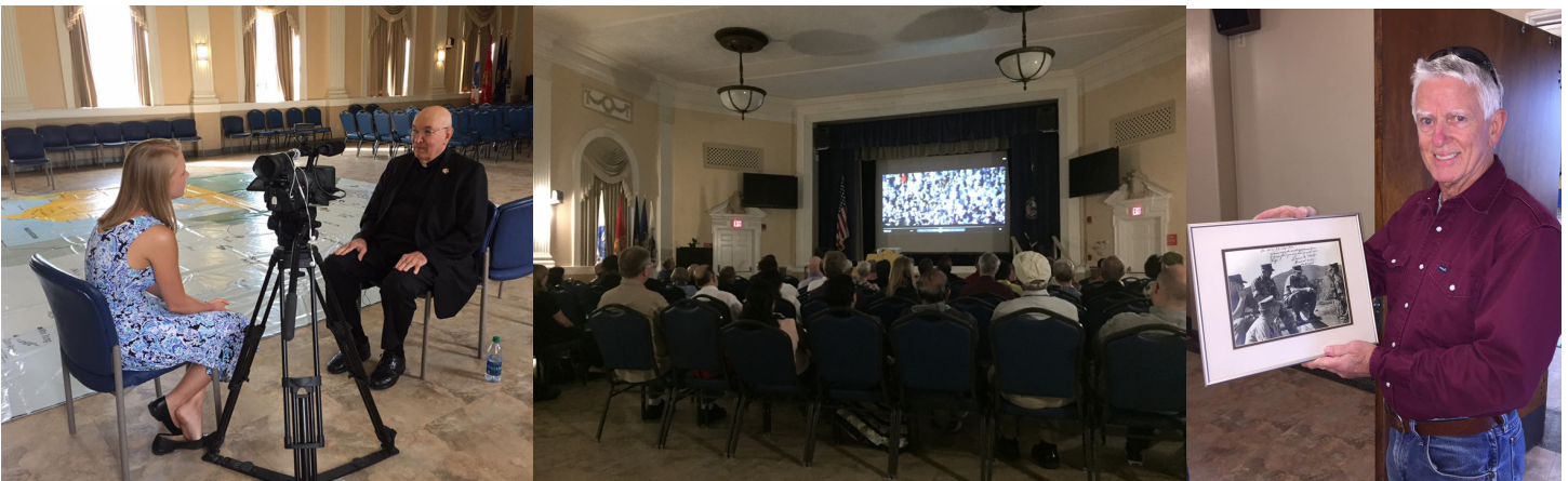
The Vietnam War screening event and Story recordings, Alexandria, LA.