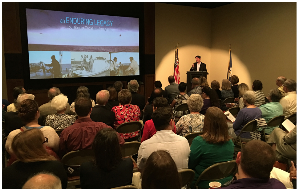
Enduring Legacy: Louisiana's Croatian-Americans screening.