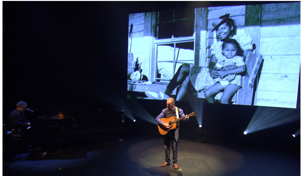
Zachary Richard performs in Attakapas: The Cajun Story.

On Thursday, April 6, LPB and Louisiana State University Libraries hosted a free preview screening event of The Great War: American Experience at Hill Memorial Library on LSU’s campus. The screening coincided with the library’s World War I exhibit.