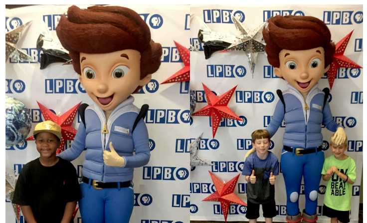
Ready Jet Go!: Back to Bortron 7 screening.