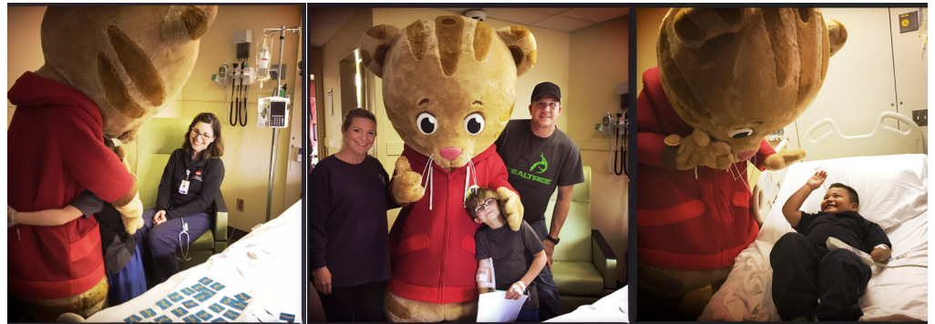
Daniel Tiger visit to Our Lady of The Lake Children's Hospital.

LPB has plans for more engaging productions and educational opportunities in 2018. We will continue to support our local communities, provide entertaining events for all age groups, and offer great programming each and every day of the year!