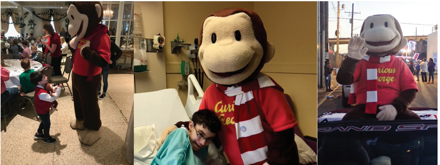
Curious George' Very Monkey Christmas Breakfast, visit to Our Lady of The Lake Children's Hospital, and appearance as Kid's Grand Marshal in Baton Rouge Christmas Parade.

the State Capitol during the State Legislative Session.