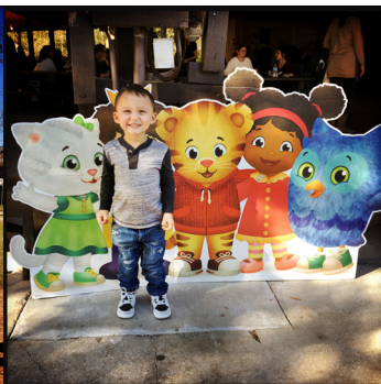
Daniel Tiger's "Be My Neighbor Day"