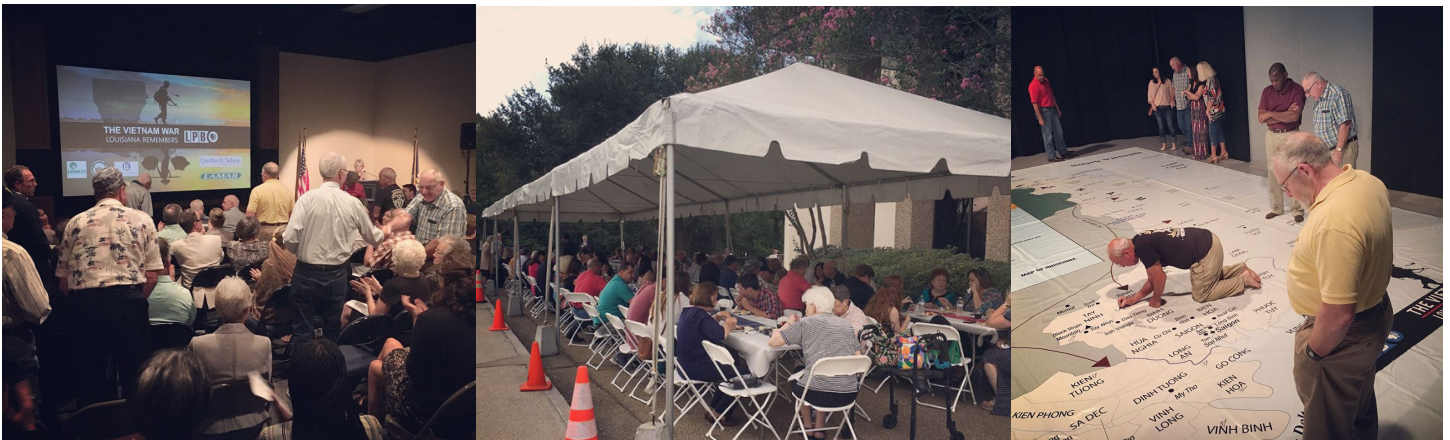
The Vietnam War screening event, Baton Rouge, LA.