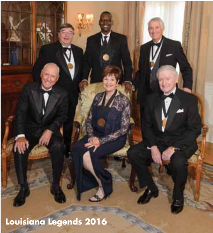
Louisiana Legends 2016