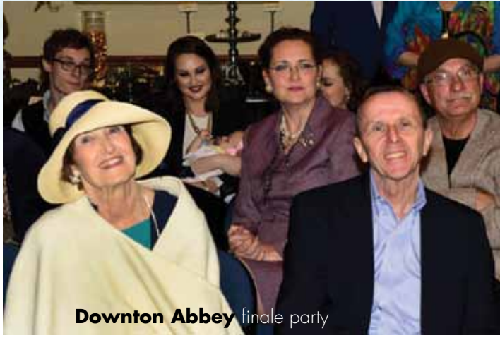
Downton Abbey finale party

At the end of December, Friends of LPB hosted a Holiday Tea inspired by Victoria on Masterpiece . A group that spanned several generations enjoyed delectable pasties and other tasty treats while seeing a preview of the premiere episode of Victoria on Masterpiece .