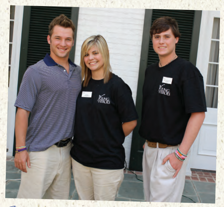
This group has been through tougher times than most people will fare in their entire lifetimes. You couldn't tell because they live their lives like nothing happened. They don't consider themselves different, they're students who play sports, write essay and hang out with friends.

pent to the governor's mansion to eat lunch, which was prepared by DEMCO. After everyone finished eating, the Young Heroes were presented with certificates and took group photos. We were able to tour the governor's mansion, where a tour guide explained all the painted murals on the walls and the history of this mansion. Each governor has their own little personal item painted on the walls that reflected them when they were in office. It was really fascinating to be in the same place the governor and past governors lived.