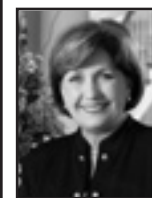
2004-TO PRESENT Kathleen Babineaux Blanco - Democrat (The first woman to serve as governor of Louisiana.)