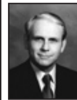
1980-1984 David C. Treen - Republican (Governor Treen was the first Republican governor since Reconstruction.)