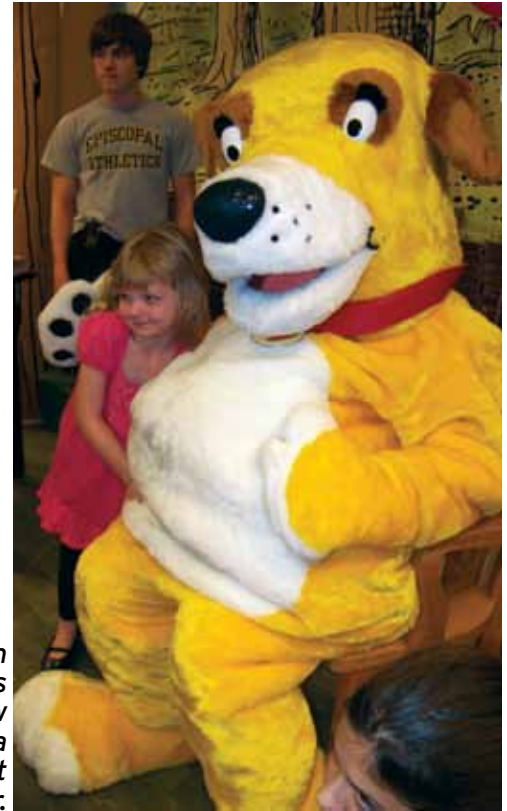
Martha from Martha Speaks made new friends at a special event in October.

kindergarteners, and the Electric Company Afterschool Program which uses the program to improve the literacy skills of elementary students and the Library.