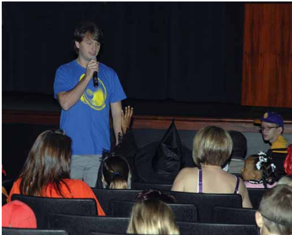
Shock from The Electric Company paid a special visit to Baton Rouge on October 31.

The national Raising Readers project is funded by U.S. Department of Education's Ready to Learn grant with support from the Corporation for Public Broadcasting, PBS, and the Ready to Learn Partnership.