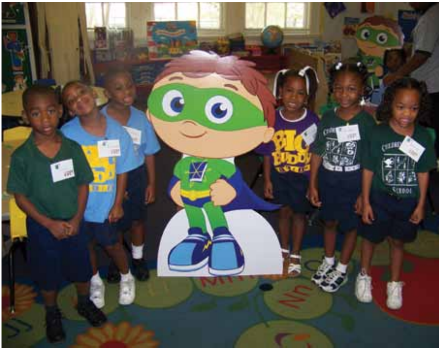
Super WHY! Camp in Baton Rouge

A special kickoff featuring PBS Kids star Elmo launched the Raising Readers Initiative in November 2008. Raising Readers is designed to improve the literacy of preschoolers around the state. It uses research-based, innovative television programs and related multi-media content to help children between the ages of 2 and 8 develop the literacy skills they need to become successful readers. It uses award-winning PBS Kids programs like Sesame Street , Between the Lions , Super WHY! , WordWorld and Martha Speaks to help improve children's vocabularies, word recognition and other literacy skills.