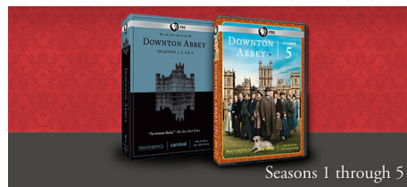
Seasons 1 through 5

NO PURCHASE NECESSARY. Winners will be selected by random drawing. Only open to the legal residents of the United States, Puerto Rico, Guam, the US Virgin Islands, the District of Columbia, and Canada (excluding the province of Quebec) who are 18 years of age or older (or the age of majority in the jurisdiction of their residence, whichever is older) at the time of entry. Grand Prize travel must take place July 26, 2015 to July 31, 2015 (flight dates subject to Delta Airlines availability). See Official Rules for full details including eligibility restrictions and prize limitations. Void where prohibited.