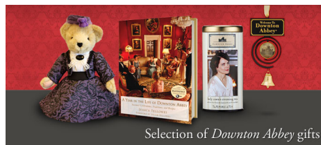
Selection of Downton Abbey gifts

Entry into the Sweepstakes also includes a chance to win one of four monthly prizes - assorted Downton Abbey merchandise from shop.PBS.org .