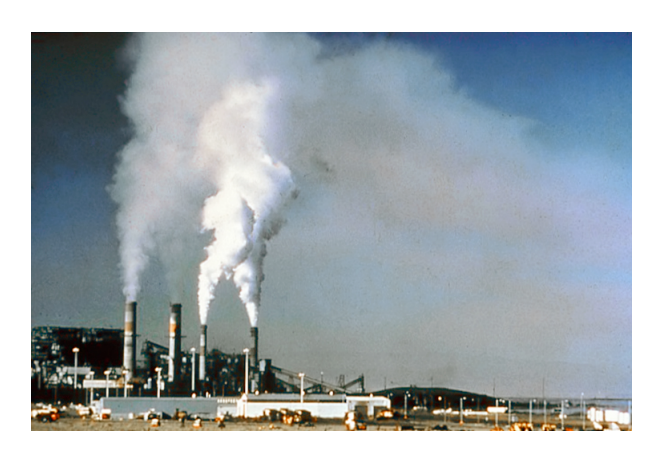
Photos 9 - 10: Pollution of Our Air<sup>27</sup> and Water<sup>28</sup>

The American peregrine falcon, which has few natural predators, was nearly incapacitated by increased use of the insecticide DDT in the post-WWII time period. By 1964, the eastern peregrine falcon was extinct in the United States. DDT worked its way up the food chain as eagles and other raptors, small birds and mammals ingested prey contaminated with the pesticide. DDT also caused the thinning of eggshells which affected birthing populations. With the banning of DDT in 1972, along with other efforts, the western peregrine experienced a resurgence in population, though they are still under watch, throughout the United States.<sup>26</sup>