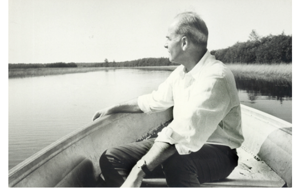
Photo: WHI Image ID 56854, from Cohen, Sheila Terman. Gaylord Nelson: Champion for Our Earth. Madison: Badger Biographies Series, 2010

1. "Intellectually, we finally have come to understand that the wealth of this nation is its air, water, soil, forests, minerals, rivers, lakes, oceans, scenic beauty, wildlife habitats, and biodiversity. Take this resource base away, and all that is left is a wasteland. That's the whole economy. That's where all the economic activity and all the jobs come from. These biological systems contain the sustaining wealth of the world" (page 157).